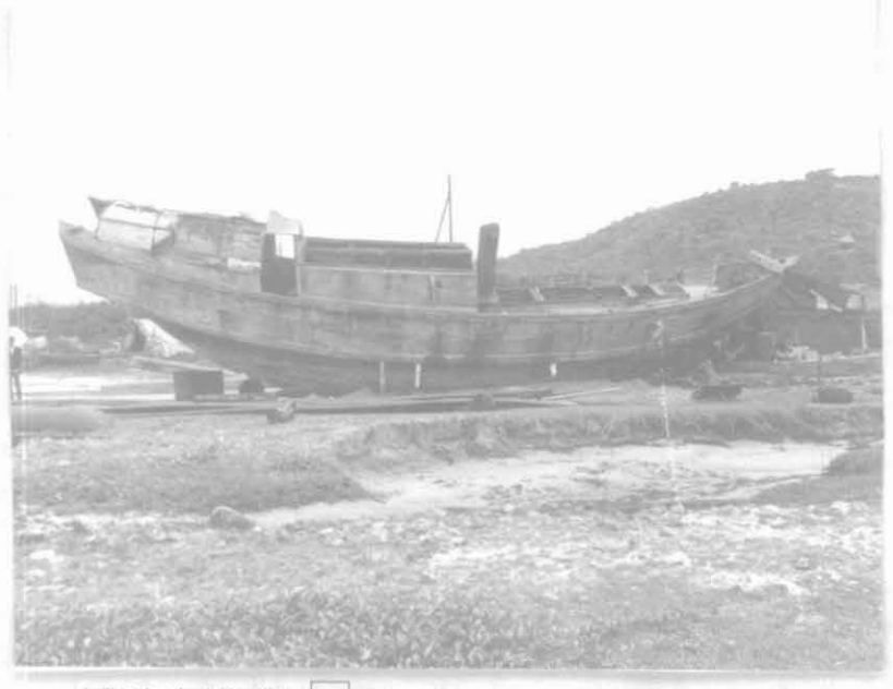
Infiltration junk Nautilus I

results of a "definitive study," it was proceeding with the agent material at hand.4