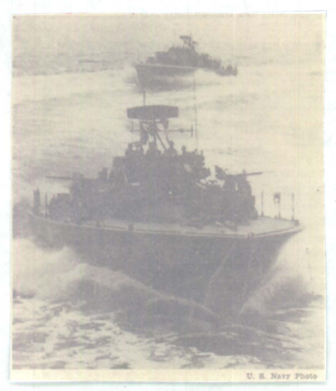
Faded newspaper clipping of patrol boat of the type intended for sabotage operations in North Vietnam.

With an acceptable aircraft in the inventory and the Swifts and Nastys on the way, the Agency used the summer of 1963 to experiment with various technological fixes to the problem of inserting and supplying teams within striking distance of their targets. The scarcity of suitable drop zones, in particular, sparked efforts to deliver men and materiel with greater precision, in more difficult terrain, and in areas posing greater danger to the program's aircraft. Saigon wanted devices permitting low-altitude opening of chutes for supply bundles dropped from high altitude. It also asked for beacons, to be attached to cargo bundles, that could be