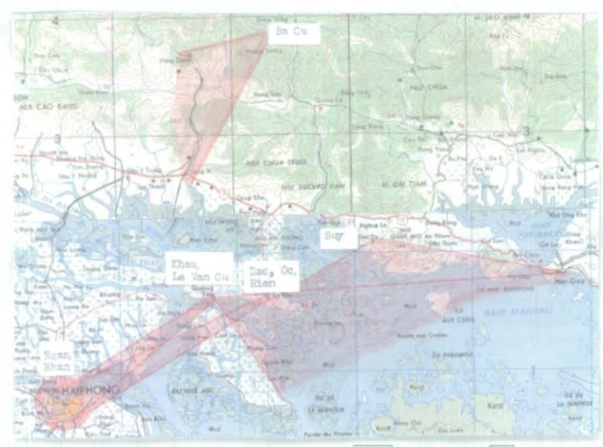
Map showing the geographical range of reported